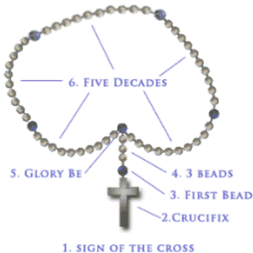
Diagram from USCCB, Accessed 9-29-19