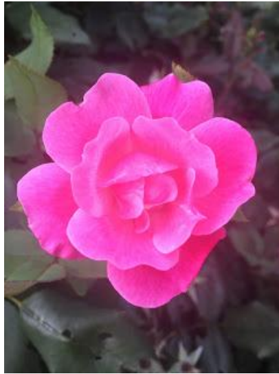
Rose Aglow, DETrees, 2017

In the name of Peace and Love and Grace. Amen.